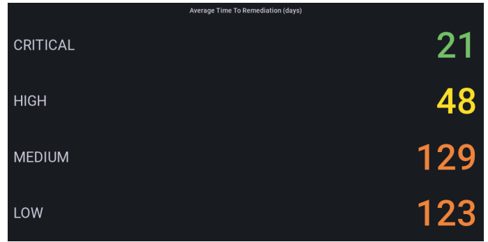
Figure 1: Average Time to Remediate Issues by Severity (days)

The real-time dashboard allows the organization to easily observe the status of open issues as well as those items which have been remediated. The robust reporting provides them with data and graphs needed to support their KPIs which are reported to the board.